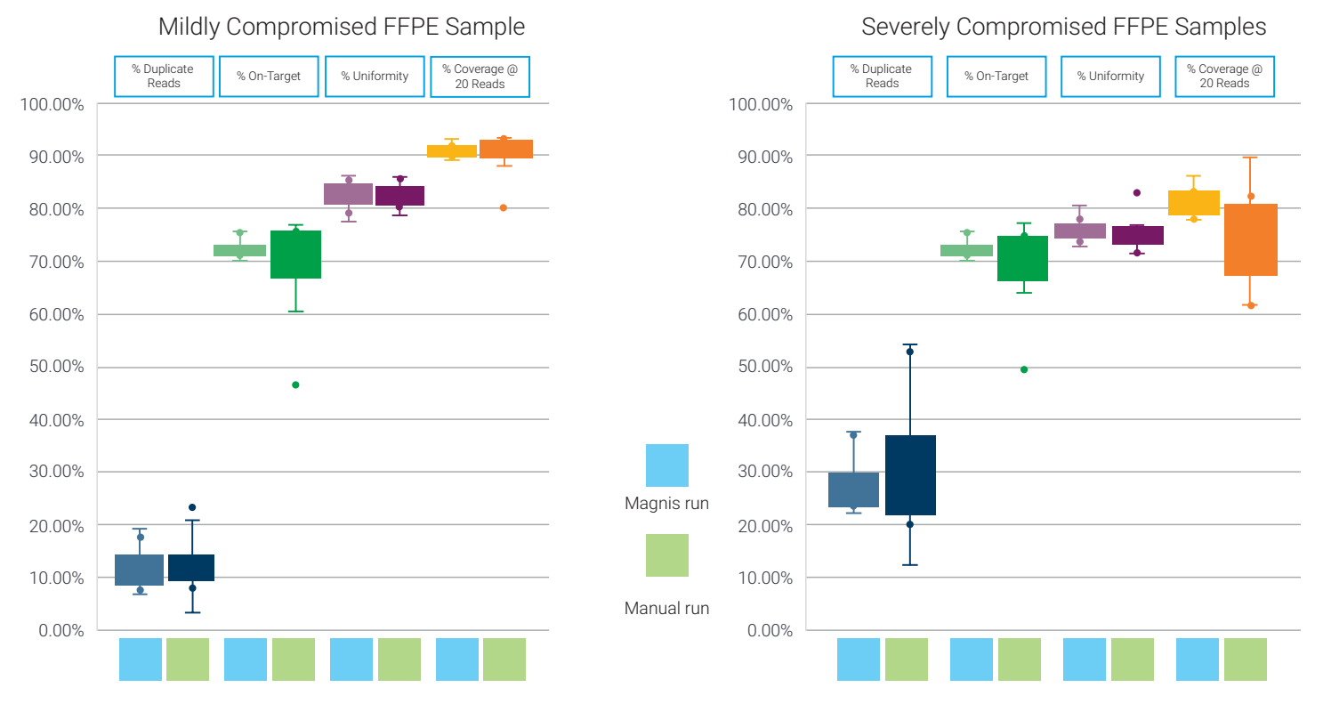
Figure 3. Quality of libraries generated by Magnis compared with those by manual prep. 10 ng of gDNA was extracted from both mildly and severely compromised FFPE samples, mechanically sheared, and used in each of the five Magnis runs with a 118 kb custom NGS panel. Sequencing metrics were compared head to head between these two methods for each of the four categories.

Like the reagents and instrument, the Magnis protocols are developed and optimized for the industry-leading SureSelect library preparation and target enrichment technology. The first protocol released on the Magnis system, SureSelectXT HS-Illumina, is supported by SureSelect XT HS chemistry and has been extensively tested and validated with different biological sample types. Figure 3 illustrates that the Magnis performance is both reproducible and comparable to a manual workflow performed by an experienced NGS technician. With more Agilent-validated protocols becoming available in the near future, Magnis users will be able to quickly expand their applications by downloading new protocols directly to the instrument.