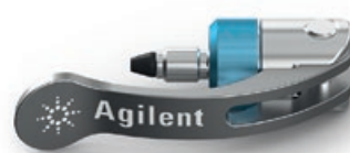
Agilent InfinityLab Quick Connect fitting

An incorrectly installed column can lead to peak tailing, peak broadening, split peaks, and carryover. Sometimes, faulty connections can also cause damage to the column. InfinityLab Quick Connect and Quick Turn fittings simplify installation ensuring a dead-volume-free column connection up to 1300 bar. These fittings reduce the failure rate during column exchange and decrease associated costs caused by destroyed columns.