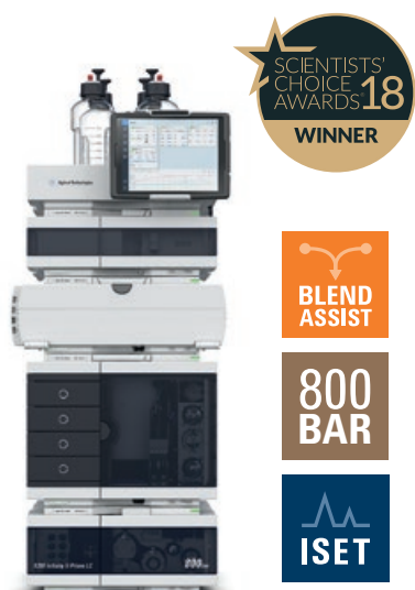
The 1260 Infinity II LC has received the 2018 Scientists' Choice Award for Best New Separations Product [2].

In addition to the Agilent Lab Investment Guide [1], this White Paper illustrates how the new capabilities of the 1260 Infinity II Prime LC can sum up to over $ 80,000 of incremental economic value per year compared to a conventional LC system. This economic value includes the following aspects: 1) reduced cost of operation, 2) reduced downtime, 3) more samples per day, and 4) the utilization of one system for many methods. This White Paper can serve as resource for lab managers while calculating the financial benefit of replacing their current instrumentation with 1260 Infinity II Prime LC.